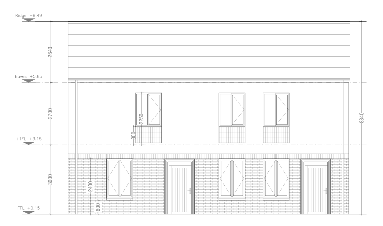
House Type T1/ T2 Semi-Detached Front Elevation