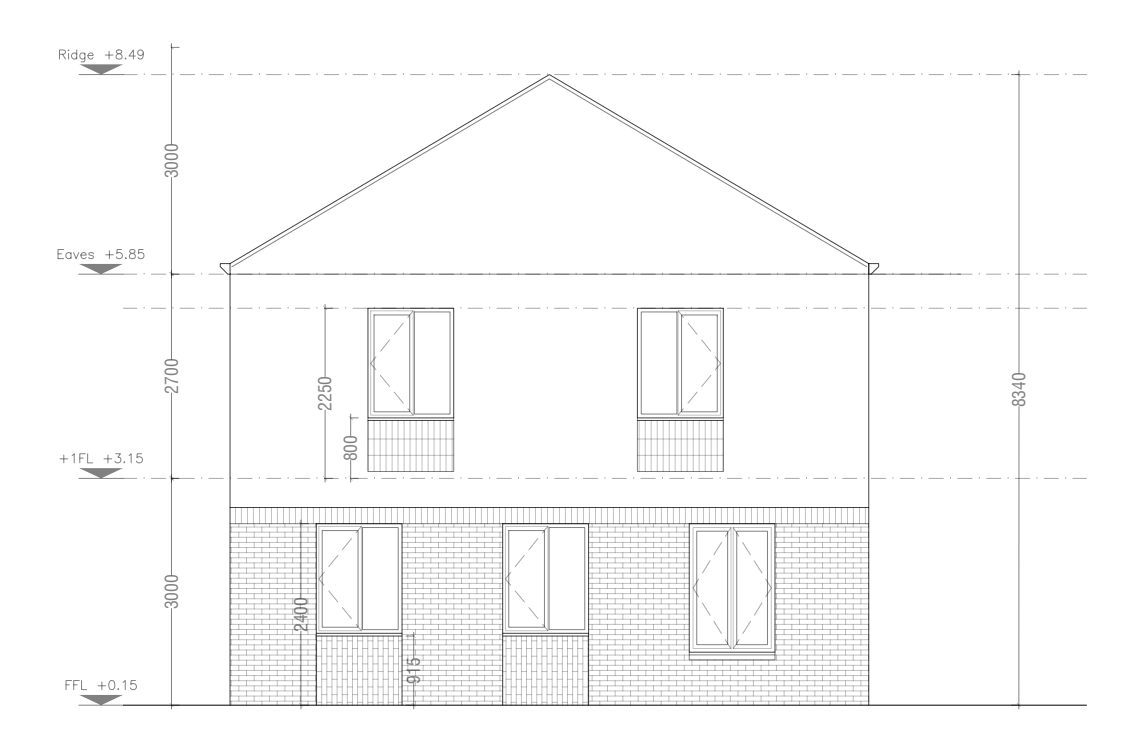
House Type T2 Semi-Detached Side Elevation